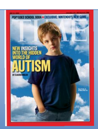
Celebrate the Children School was featured in the TIME Magazine cover story in 2005

Regular and special educators, early intervention providers, parents, administrators, OT's, PT's, SLP's, psychologists, social workers, school counselors, art and music therapists, college students, education leaders, education reform and policy makers